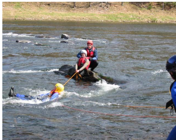
Training weekend in-water foot entrapment drill